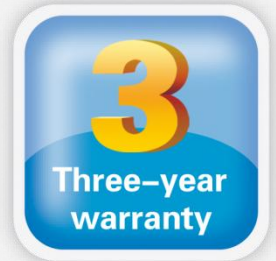
3 Three-year warranty